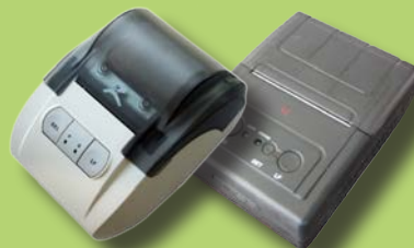
Mirco Printers for HARTIP3000/HARTIP2000